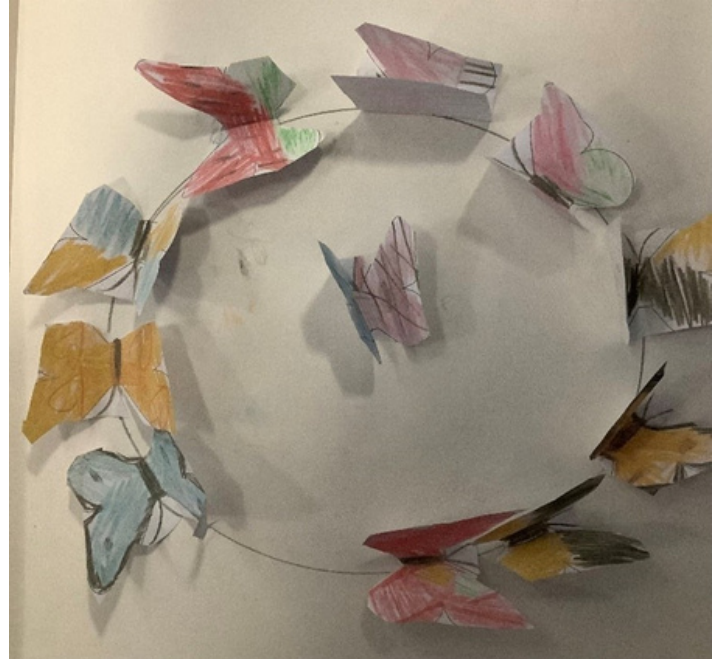
Year 1 Art

We have been learning about the paper artist and craft maker Rebecca Coles. We have been designing and cutting simple butterfly shapes out of different materials to make our own beautiful 3D pictures.