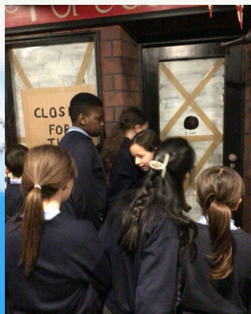
Year 6 trip to Western Approaches.

On Friday 27th January, our Year 6 children went on a trip to Western Approaches, a World War 2 bunker in the heart of Liverpool. This bunker has been referred to as being one of the most important buildings in the world to bring about the end of the War. We learned about the impact of the Blitz on families in Liverpool as well as the impact the servicemen and women of Liverpool had on the outcome of the Second World War. We got to experience what it would be like to be on the streets during this period of time, and even saw a real German bomb! We got to break codes, investigate artefacts, witness the room where the Battle of the Atlantic was fought through maps and coordinates, and we had opportunities to reflect on the impact of the war on our city. Some lucky children even got to dress up!